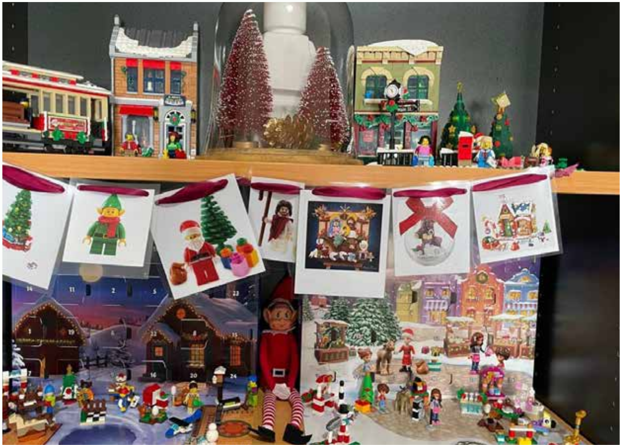
Staff at AFSS Port Pirie office have been busy putting together a lovely Christmas Lego display.