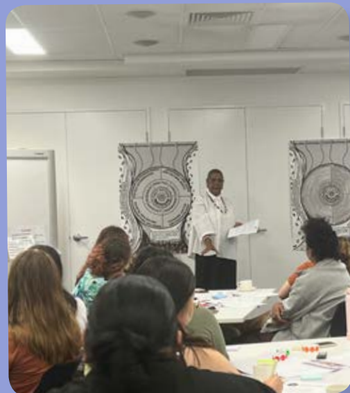
June Oscar - Aboriginal and Torres Strait Islander social justice commissioner of the Australian Human Rights Commission