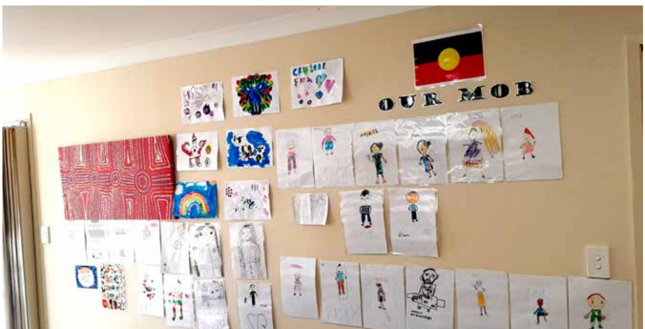
An artwork display created by kids in Residential Care, including their representation of AFSS Youth Workers and Managers :-)