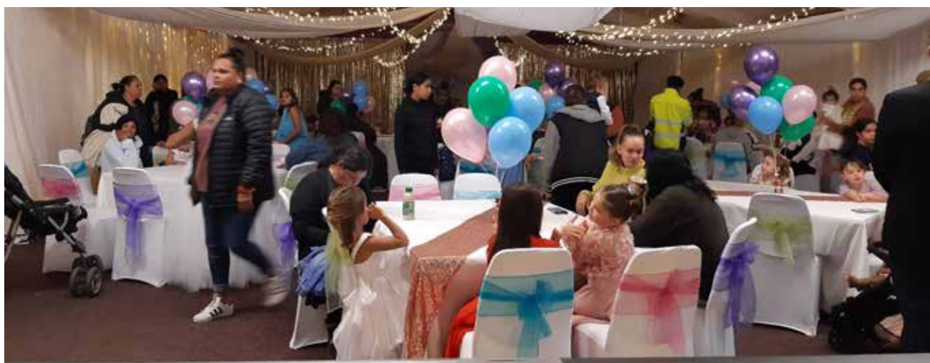
NAIDOC Week Youth Ball